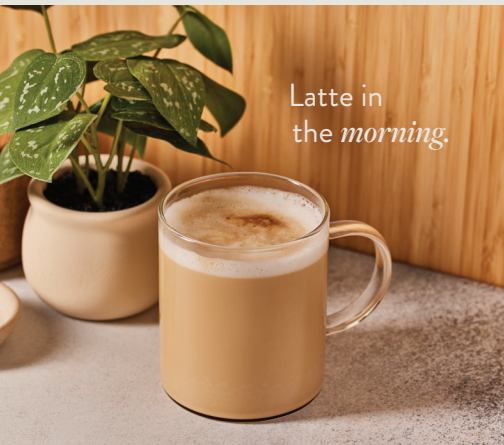
Latte in the morning .