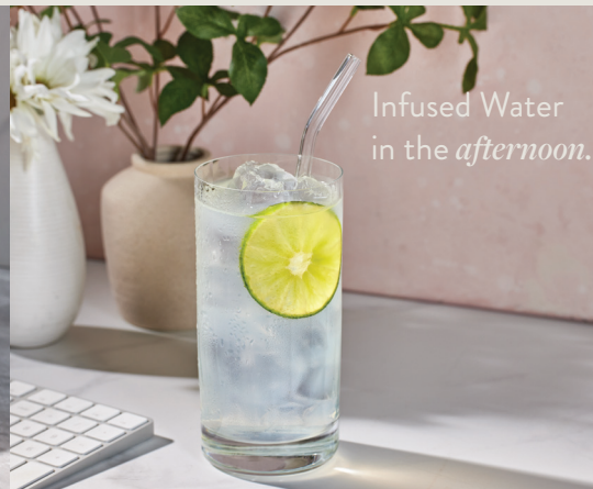
Infused Water in the afternoon .