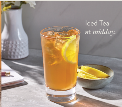
Iced Tea at midday .